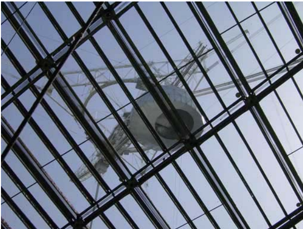
Figure 3: Gregorian dome as seen from below through adjustable surface panels.