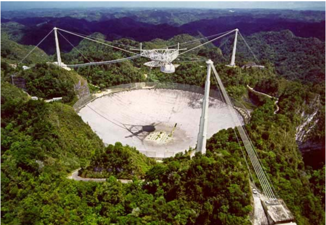
Figure 1: Aerial view of the Arecibo radio telescope showing the large primary reflector, the suspended platform with Gregorian dome housing the secondary and tertiary reflectors, and the platform support towers.

The largest single dish radio telescope in the world is located at the Arecibo Observatory in Puerto Rico. First operational in 1963, the observatory is today part of the National Astronomy and Ionosphere Center (NAIC). The NAIC, a research center operated by Cornell University in cooperation with the National Science Foundation, enables research in astronomy, planetary studies, and space and atmospheric sciences. The performance of the telescope depends to a great extent on the primary reflector surface. This spherical surface is composed of 38,788 perforated aluminium panels. Deviation of these panels from an ideal spherical surface is attributed to a variety of causes. These include ongoing soil motions and construction damage that occurred during the most recent upgrade, completed in 1997. Previous adjustment of this surface has been based upon theodolite measurements. As current surface error requirements could not be achieved in this manner, a photogrammetric approach has been adopted. This paper begins with a brief overview of the Arecibo radio telescope. The survey, analysis, and results to date of the photogrammetric measurement of the primary reflector surface are described, followed by an outline of future work.