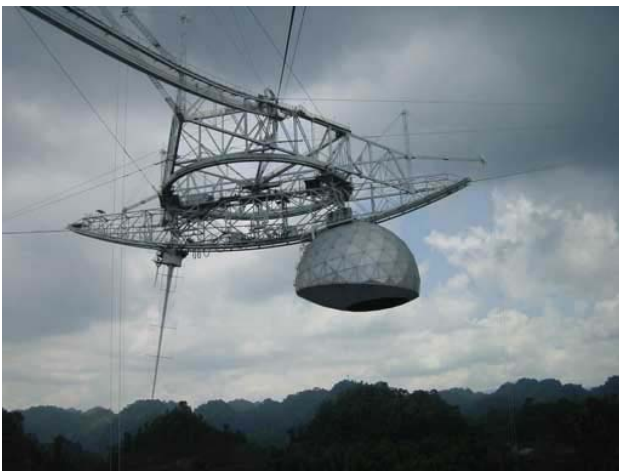
Figure 2: Suspended platform with azimuth arm supporting the radome on the right and 96 foot line feed receiver on the left. The secondary and tertiary reflectors and horn feeds are housed within the radome.

Photogrammetric surveys of the primary reflector surface were performed in the autumn of 2000; January, 2001; and again in May, 2001. In the following, the surveys, analysis, and results to date are described and future work is outlined. The paper begins however, with a brief history and description of the telescope itself.