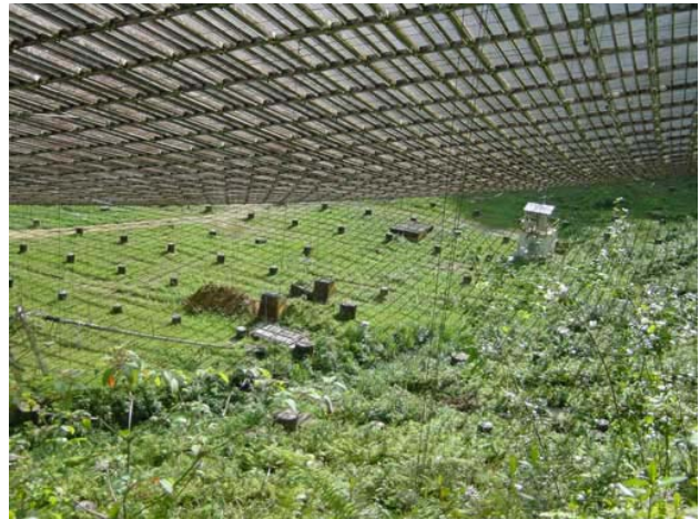
Figure 4: View underneath primary reflector showing tieback cables and blocks.

With the capability of adjusting the surface, the upper operating frequency increased to approximately 3 GHz. However, line feed receivers could not be constructed to specifications allowing operation at the highest usable frequencies. As a result, a second upgrade began in 1992. All but one line feed receiver were replaced by a Gregorian reflector system which would permit operation over the full frequency range afforded by the improved accuracy of the primary reflector, 8 GHz or higher. This system consists of specially shaped secondary and tertiary reflectors (Figure 5). These reflectors are housed within a 90-ton radome designed to protect them from adverse weather (Figure 2). The radome is suspended from the azimuth arm, 450 feet above the primary reflector surface. The new reflector combination brings the incoming radio waves to a single focal point maintained within a one-eighth inch circle (Steele, 1997). The line feed receivers (save one) were replaced by a variety of feed horns mounted on a rotating plate in such a way that they can be moved into the focus. Also part of the upgrade was the installation of a 50 foot high steel wire mesh ground screen around the dish, shielding the receiving system from radio noise radiated from the surrounding ground. The second upgrade was completed in 1997. More detailed descriptions of the Arecibo system design may be found in Kildal et al. (1991,1994).